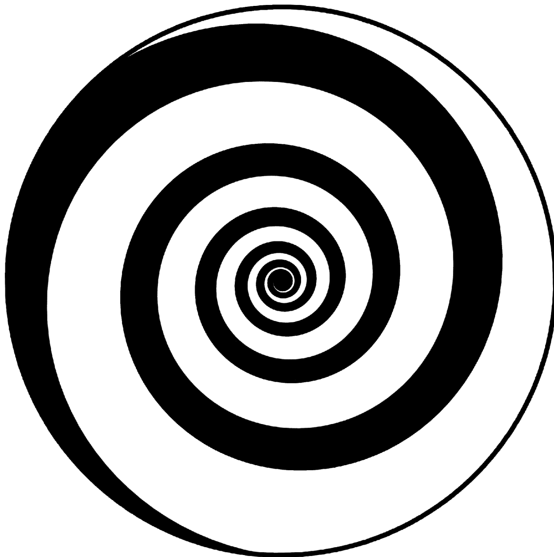
An alternate spiral pattern provided by Paul Stoffregen.